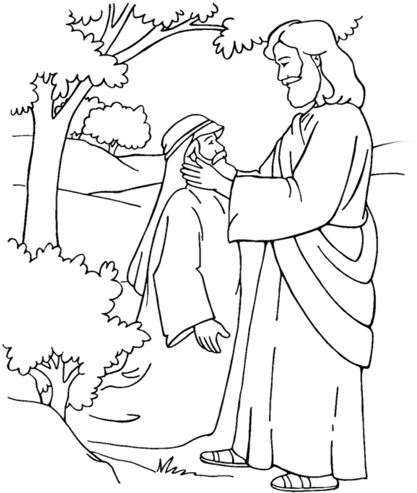
Jesus Heals Deaf Man