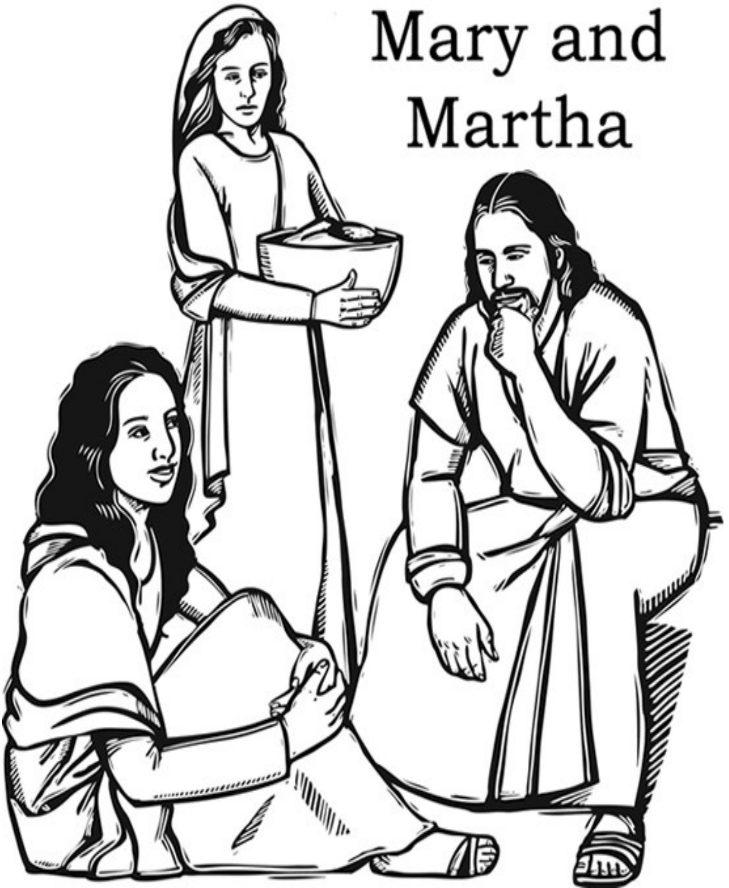
Jesus in the home of Mary and Martha.