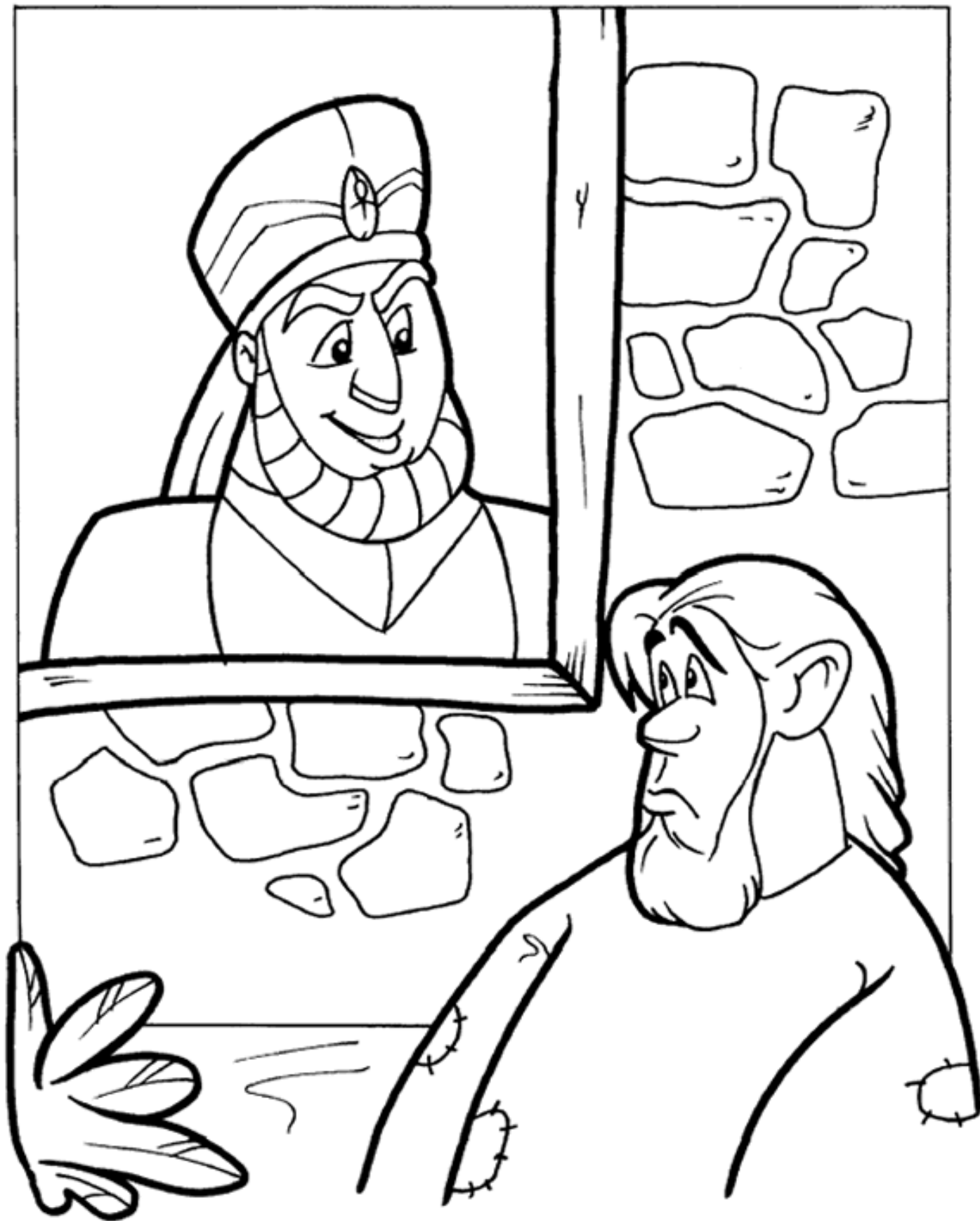
The Rich Man and Lazarus Luke 16:19-31