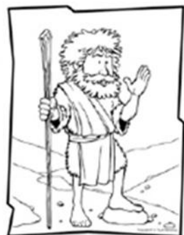
JOHN THE BAPTIST Matthew 3

W L U Z M H V J O J Q V Q S U I Y V S L O G N K M D B H A K K C T X T N M R H K Y T E X X C I X J T E Z Y J T A E S L E P N N Y Y Y A S L P P T R Z T R B M G J W I L D G S U E S Q E D A H D H A I R U X G P T C P Z O P Y O U S C E N U E R F A T O Q T W M O H I N J N A F R Z S G N I L O H L R L T I M E Z J N P O Z C P N E P Y G P E S P O A E A E H M N N Z H C L O R D H E M T A F T Q X T Y J W K K R N J C U Y C T Q T U I X E P F N M H L D Z D E N I