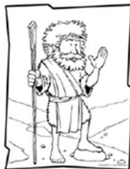
JOHN THE BAPTIST Matthew 3