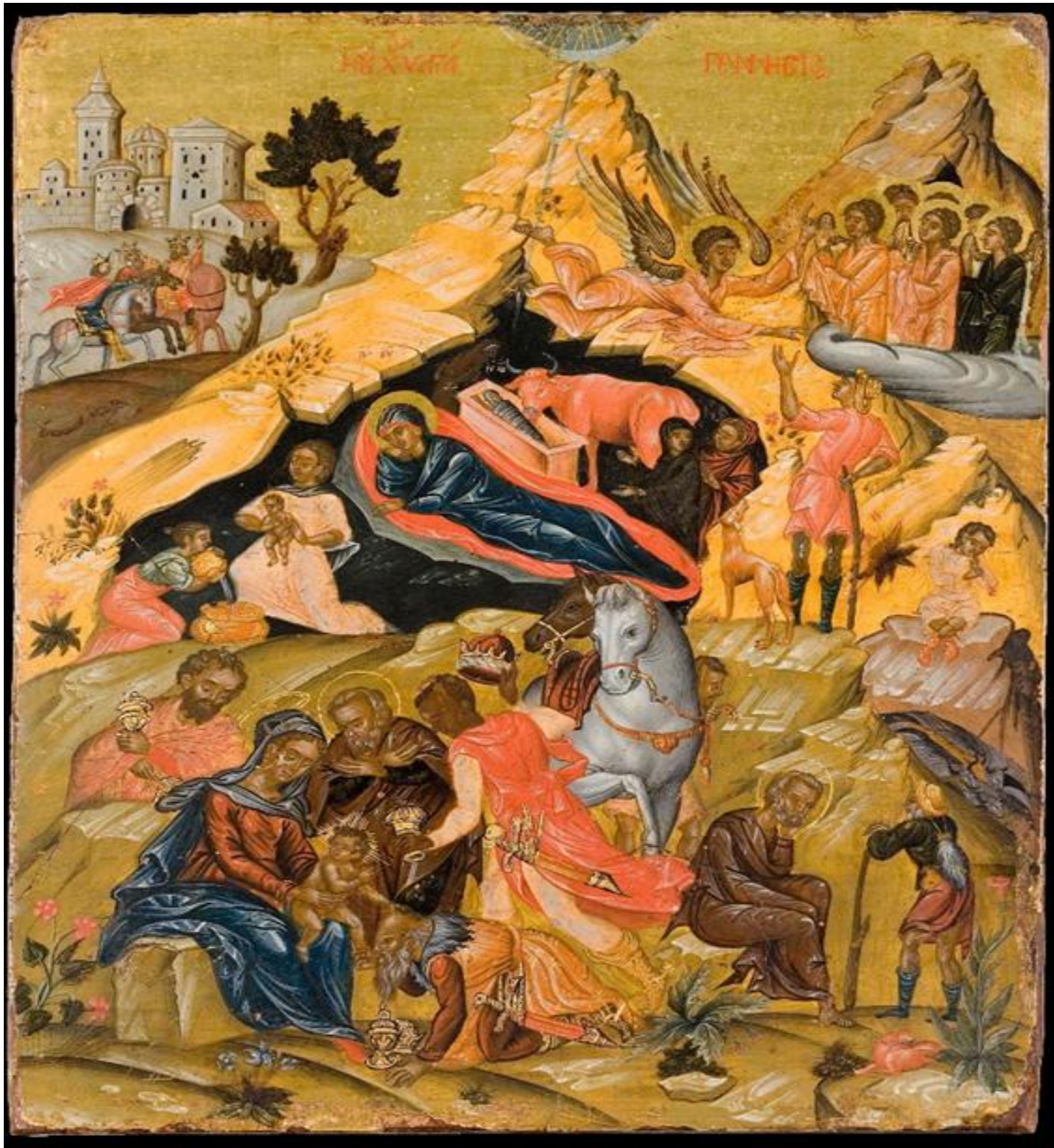
The Nativity and the Adoration of the Magi, Greek Orthodox icon, circa 17th century. / El nacimiento y la adoración de los Reyes Magos, icono ortodoxo griego, circa siglo XVII.

Dear people of God in The Episcopal Church,